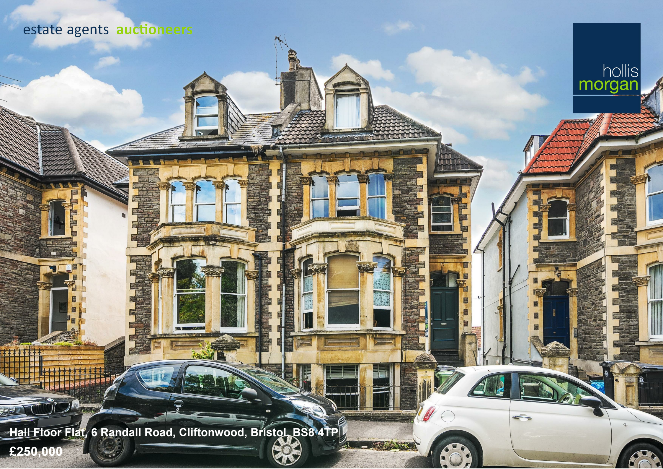
Hall Floor Flat, 6 Randall Road, Cliftonwood, Bristol, BS8 4TP